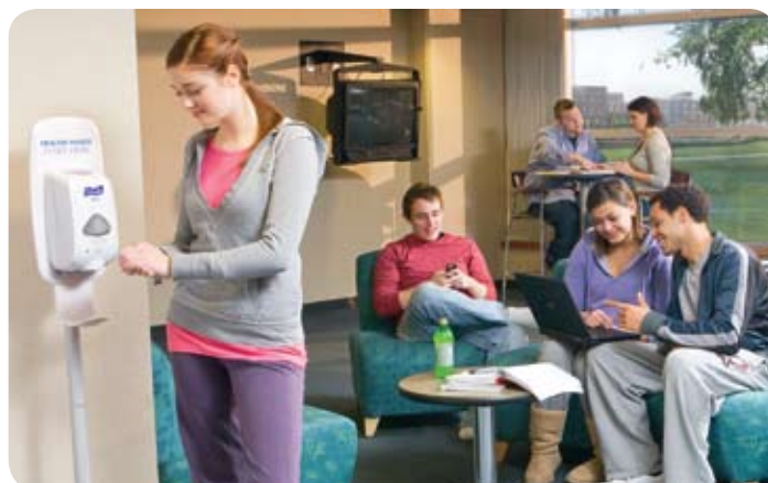
PURELL, America's #1 instant hand sanitizer, makes effective hand hygiene simple anywhere.