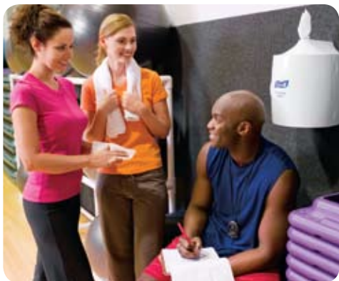
Conveniently clean and sanitize, perfect for recreation centers