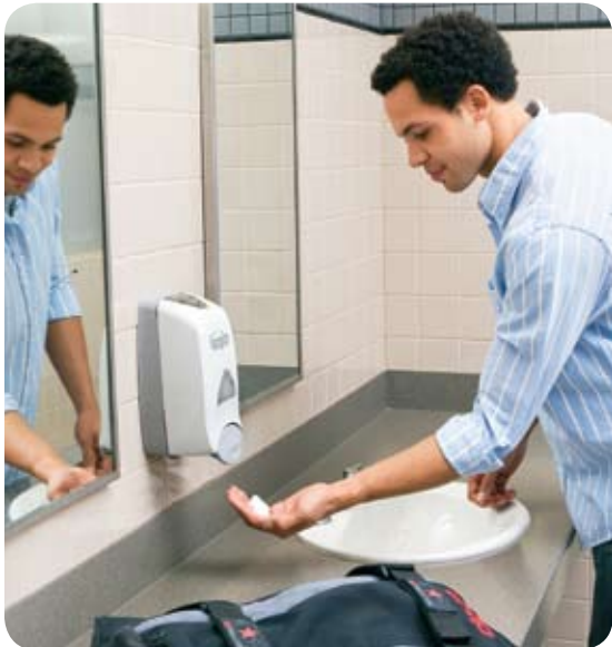
High-capacity, SANITARY-SEALED systems simplify maintenance.

Everywhere students gather, share materials, and connect, you can promote a healthy campus attitude. Your GOJO comprehensive solution makes hand hygiene available and highly visible.