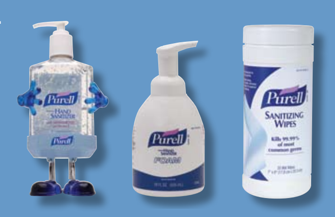
PURELL is also available in sizes to fit anywhere.