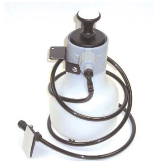
Optional Spray Kit

Cleans 7,500 sq. ft. per hour and 15,000 sq. ft. on one battery charge!