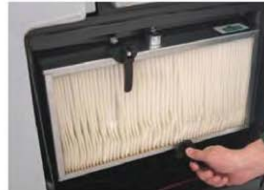
Filter panel also available in washable polyester material