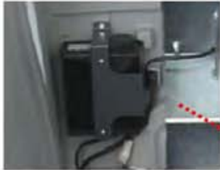
On board charger