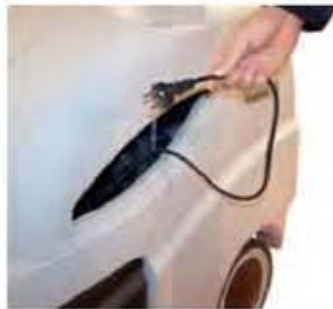
Cable compartment accessible from machine side opening