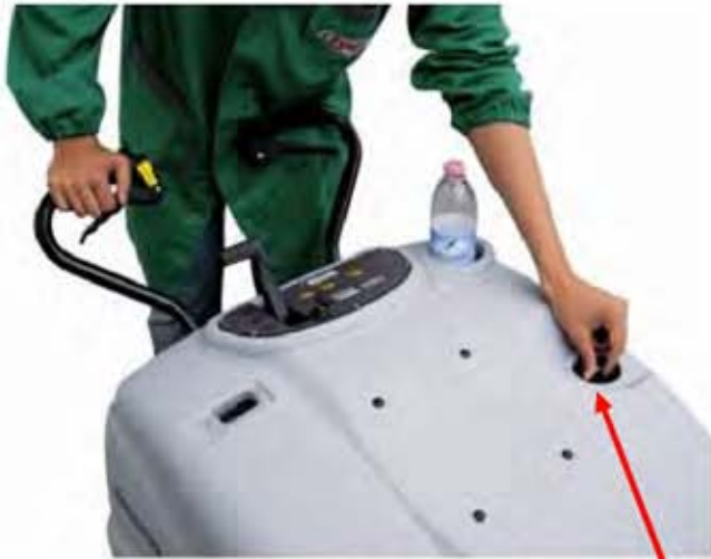
Brush pressure adjustment knob