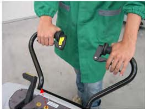
Side brush lever