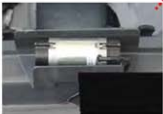
Electric filter shaker motor