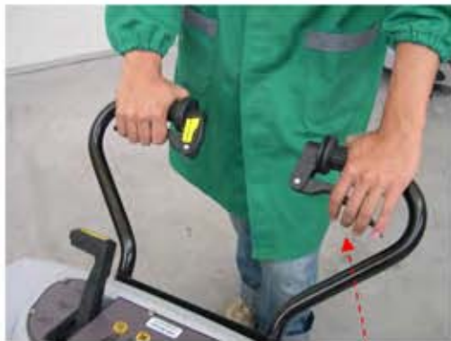
Easily operated by pressing lever on left hand side