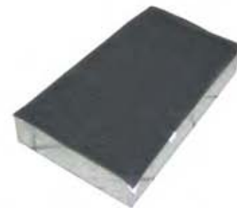
Pre-filter utilized to capture carpet fibre when used for carpet cleaning