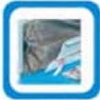
Dust flap for large debris collection