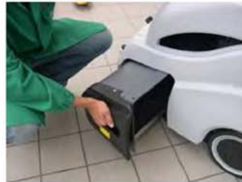
Light weight hopper material to allow easy dumping