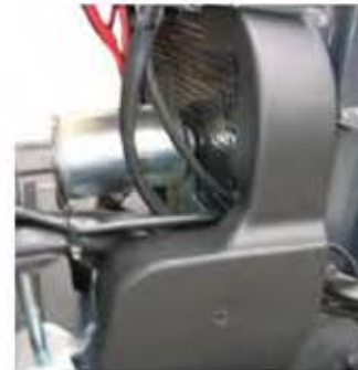
Low noise electric vacuum unit can be used for day cleaning