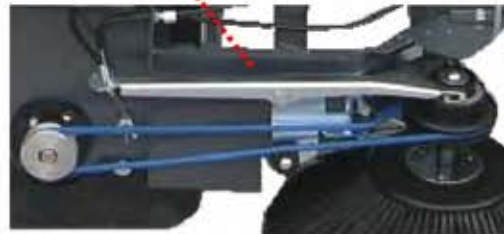
Easy access side brush belts