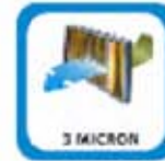
Dust micro filtration