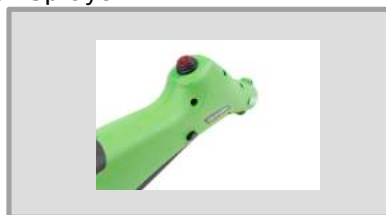
Electrostatic Red Button