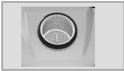
Backpack Tank Screen