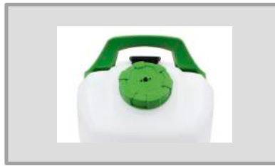
Backpack Tank Cap