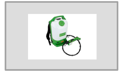
Backpack with Handle