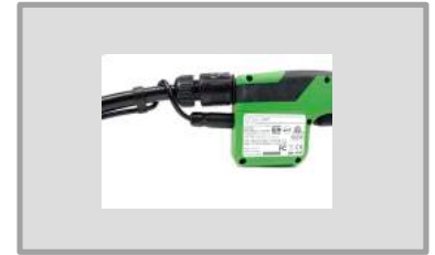
Quick Release Connectors