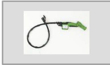
Electrostatic sprayer wand