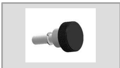
Door Lock Knob