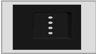
LED Battery Light Indicator