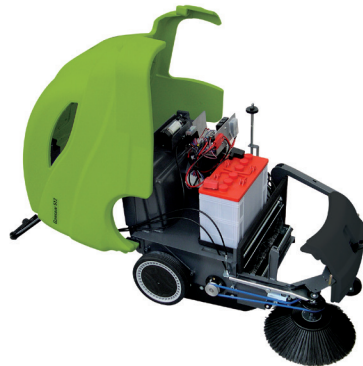
Easy access to internal components Simple to tilt entire top body