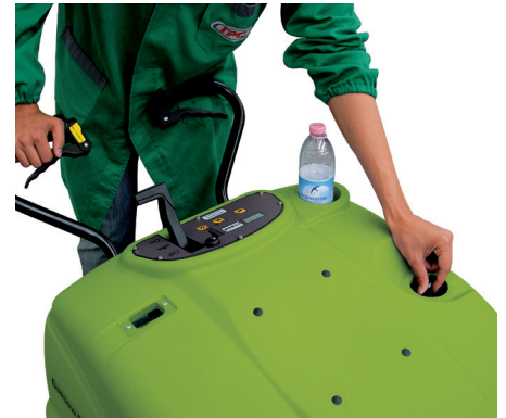
Maximum brush wear saving - Main brush pressure is easily adjusted from walking position