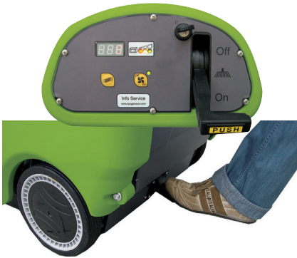
Maximum comfort and extreme ease of use